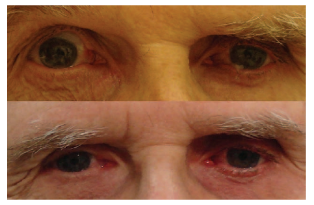
FIG. 2. Top , Right upper eyelid retraction with exposure of bleb and MRD1 of 6.8 mm before repair. Bottom , Eyelid appearance 3 months after conjunctiva-sparing anterior blepharotomy with right MRD1 of 3.5 mm and satisfactory eyelid contour. MRD1, margin reflex distance 1.

Trabeculectomy bleb-induced eyelid retraction appears to be an accepted diagnosis with an unclear mechanism.<sup>1</sup> Three